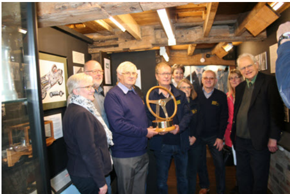
Owen motor Group